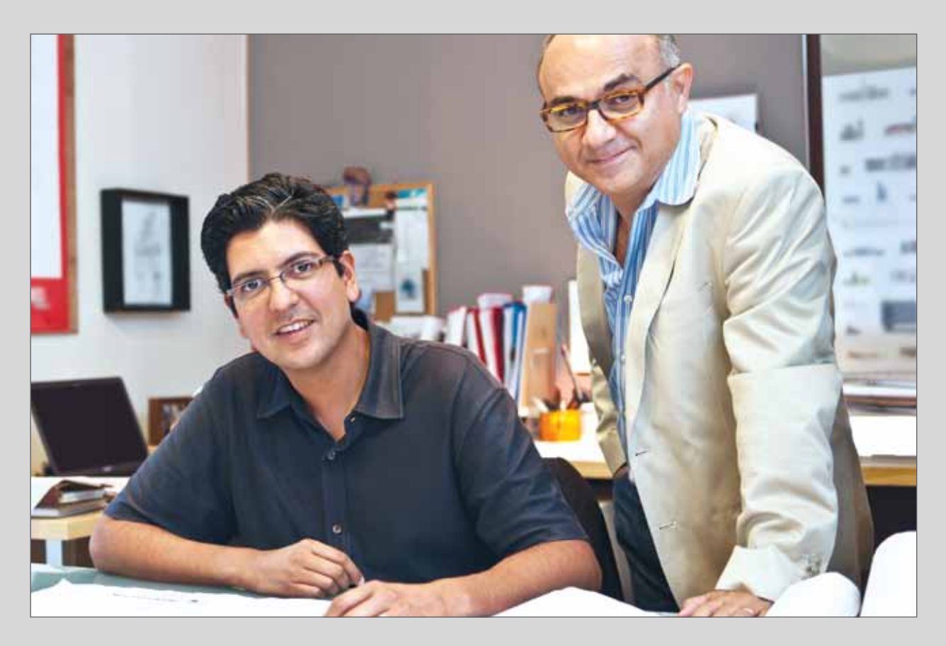
We can help you develop, implement and monitor a retirement or benefit plan that suits the needs of your business and your employees.