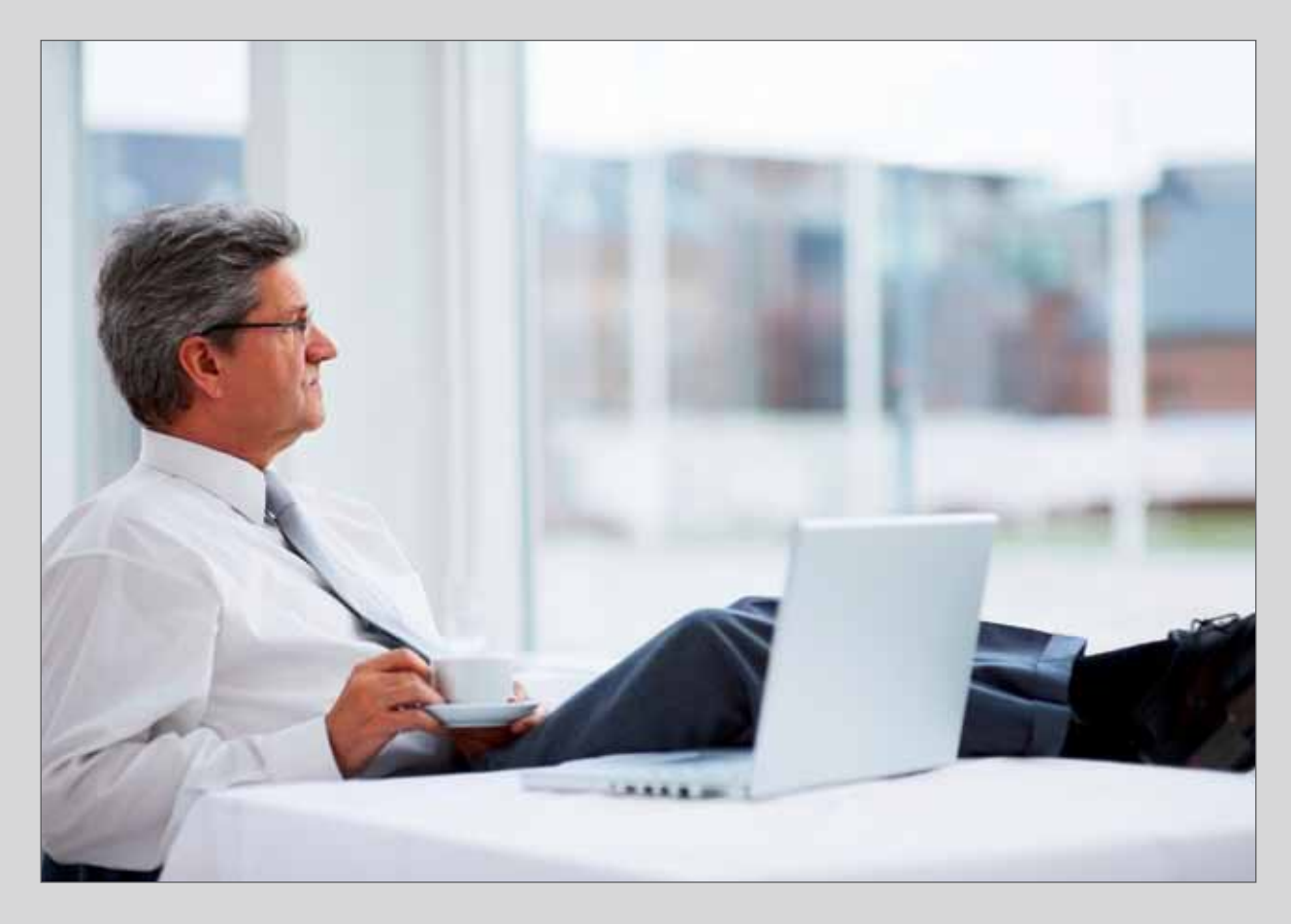
We know that by providing you with many options to access and monitor your portfolio, we can help make your experience with us not only fulfilling but enjoyable, too.