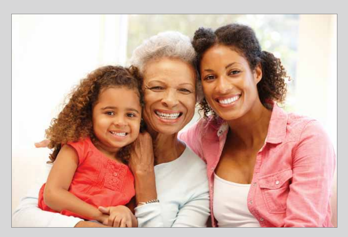
Nothing beats the feeling of knowing there's someone you can count on to look after you and the things that matter most in your life.