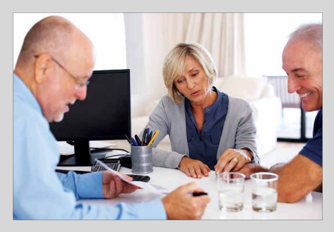
A disciplined approach provides a structure that enables your advisor to create financial strategies as unique as each individual client.